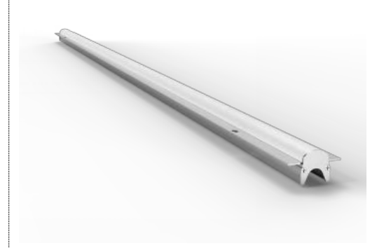
Application Environment: Indoor Outdoor